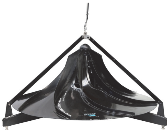
The HYPERDIVE® -Mixer ready to go

After a short test run and a check of the direction of rotation the HYPERDIVE® -Mixer can start operating without any further work. It is designed for permanent operation and does not require intensive maintenance work.